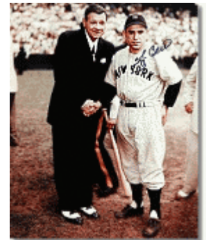
Babe Ruth and Yogi Berra

Are quotes of Yogi Berra, revered catcher for the New York Yankees, who was also famous for fracturing the English language in peculiar, provocative and interesting ways. Perhaps his most famous line was uttered during the 1973 National League Pennant race – "It ain't over 'til it's over."