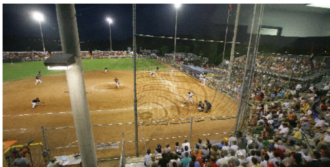
Action under the lights at Peter Hallman Ball Yard

The ISC World Tourney, scheduled for Peter Hallman Ball yard in Kitchener for nine days from Friday August 10 to Saturday 18 will crown a new champion, with the defending champion County Materials of Marathon, WI disbanding following a stint as three-peat champions. Early season predictions suggest that as many as eight or nine teams have legitimate shots at claiming the title, notably the #1 ranked Orillia Quaker Riversharks and the host Kitchener Hallman Twins .