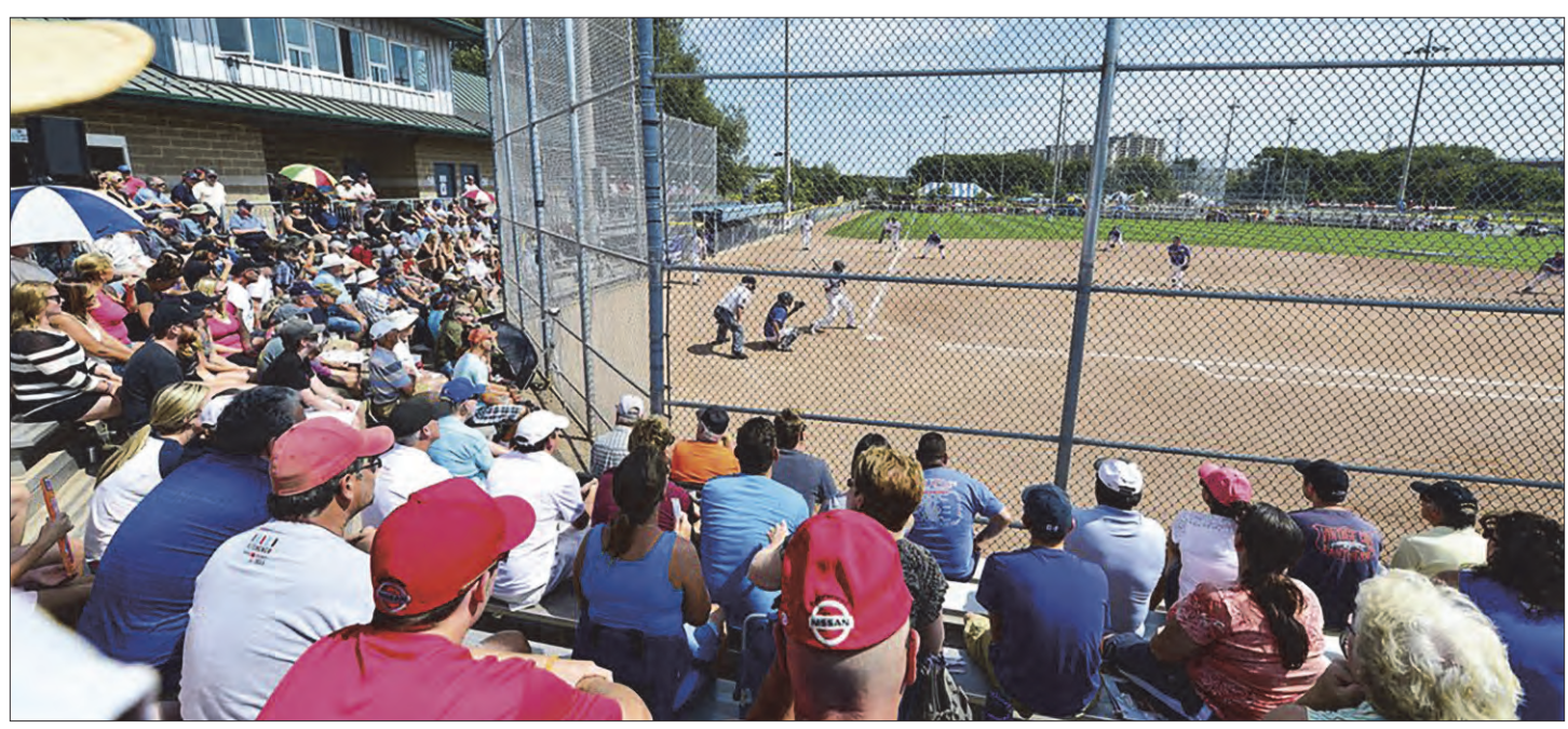
Fans enjoy Diamond #1 sight-lines at the scenic and fan-friendly Peter Hallman Ball Yard, home of the International Softball Congress 2018 World Tourney. Months of planning sets the stage....Welcome to the Show!

For the fifth time in seventeen years, Kitchener's renowned corps of dedicated and enthusiastic volunteers is hosting the prestigious International Softball Congress (ISC) World Tournament during Saturday August 11-18.